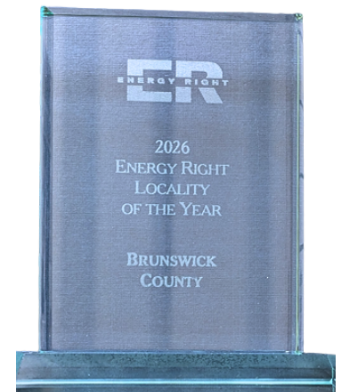
Energy Right presented Brunswick County with the Locality of the Year Award for 2026.

The award serves as another example of Brunswick County’s continued efforts to position itself as a forward-thinking community that embraces opportunities for growth while protecting the interests of its residents and future generations.