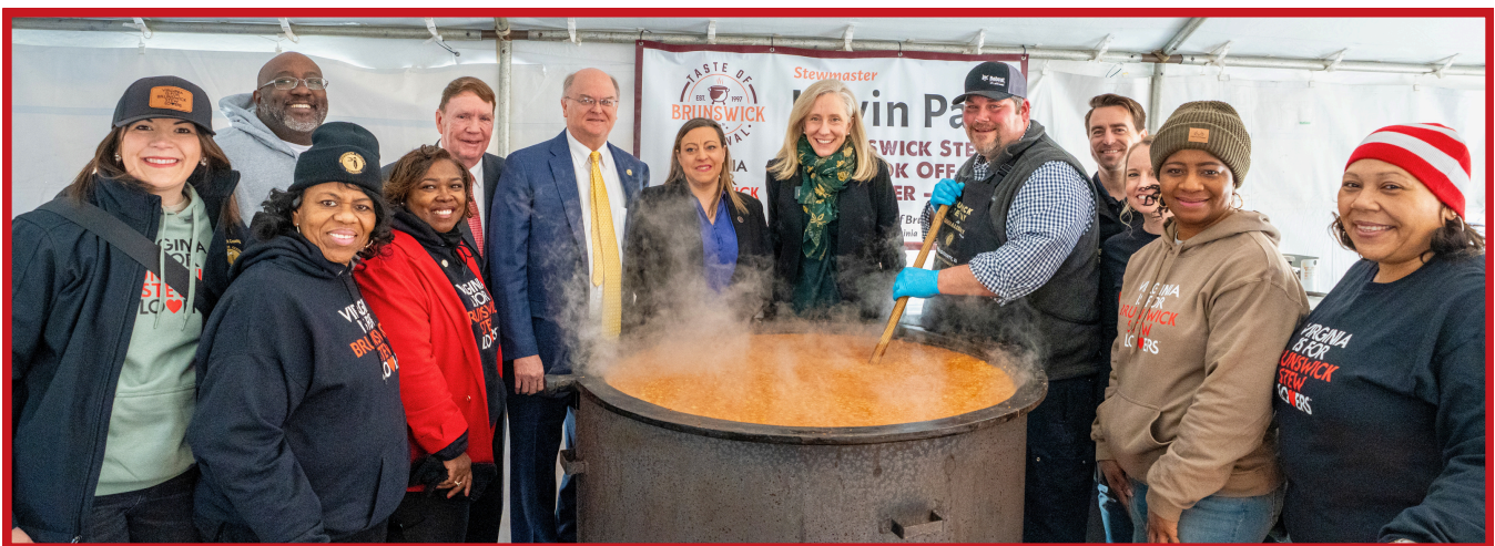
Governor Abigail Spanberger, Virginia's first female Governor, joined the celebration and even took her turn stirring the massive cast iron pot. She shared how delicious the stew smelled and couldn't wait to enjoy a taste of Brunswick County's signature dish.

Thank you to everyone who helped bring a true taste of home to the heart of Virginia's capital!