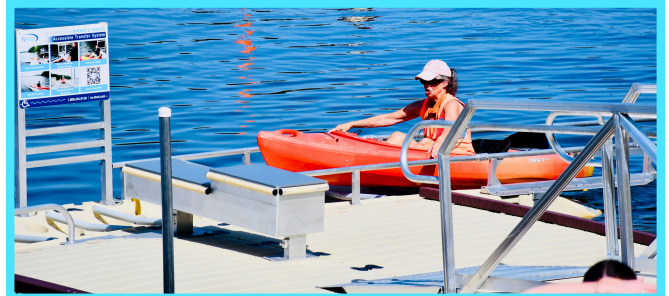
Pictured Left: An overhead drone photograph of Herman Road Lake Gaston Day Use Park. Top Right: The Grand Opening and Ribbon Cutting Ceremony took place near the handicap-accessible kayak launch located just off the shore of Lake Gaston on Friday, April 24, 2026. Bottom Right: A local outdoor recreation enthusiast demonstrates the new public access kayak launch.

Brunswick County officially celebrated the grand opening and ribbon cutting of the new Herman Road Lake Gaston Day Use Park on Friday, April 24, 2026, marking an exciting new chapter for outdoor recreation, tourism, and public access along Lake Gaston. Located in Bracey, Virginia, the new waterfront park provides residents and visitors with free, safe, and convenient public access to Lake Gaston – something that has historically been limited due to much of the shoreline being privately owned. Constructed by local contractor Clary Construction, the park features a fully ADA-accessible kayak and canoe launch, improved roadway access, and expanded parking accommodations designed to support paddlers, outdoor enthusiasts, and families looking to enjoy the lake. Future phases of the project may include additional recreational amenities such as a fishing pier and picnic pavilion as funding opportunities become available.